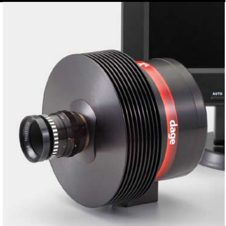
Model XLMT shown above. Standard XLMT shipment includes IEEE 1394 FireWire cable, IEEE 1394 PCI card, cooler power supply, focus wrench, Exponent software and access to SDK. Lens not included.

The Excel M cooled CCD digital camera has been specifically engineered to meet the critical demands of high resolution, low light level scientific and industrial applications. Assembled in an ISO rated clean room, the hermetically vacuum sealed cooling system maintains stringent temperature stability to ensure a high dynamic range, low noise image. The thoughtful design enables optical interface to the industry standard C-mount and single-cable connection to a PC for ease of use. The intuitive software control ensures successful camera operation for the novice and sophisticated operator. Dage-MTI advanced camera technologies are engineered to the highest standards, yet refreshingly easy to use.